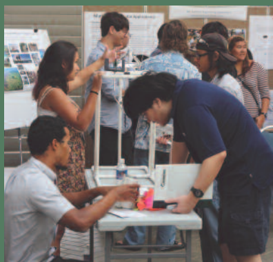
Undergraduate research students demonstrating their research project to attendees

Last September, engineering projects by Native Hawaiian students from across the UH System were featured at a student symposium called Ma Ka Hana Ka 'IKE, or "In doing, one gains Indigenous Knowledge in Engineering." Over 130 attended the inaugural event at Windward Community College, including families, faculty members and representatives of Native Hawaiian organizations and the local engineering industry.