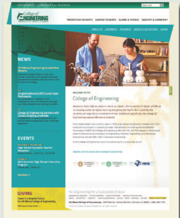
A look at the College's new website homepage (screen capture)

The new website is built on a content management system that will allow the College to move efficiently and effectively contribute content. The new website provides