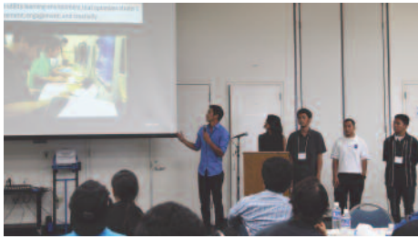
Undergraduate research students demonstrating their research project to attendees