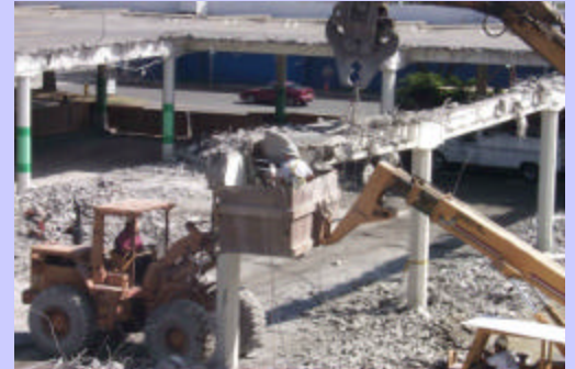
Beam Recovery for Testing