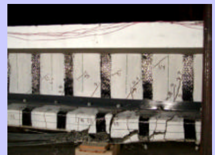
T-Beam 2 Failure