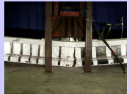
T-Beam 1 Failure